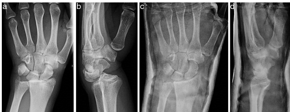
Figure 1 Simple AP and lateral radiograph obtained upon arrival at the emergency service (a and b), and after the reduction (c and d).

This pathology is extremely infrequent, with an incidence of 0.2% 2,3 of all dislocations. Type I is even more rare, as there have been less than 20 cases reported in the literature. 4,5 Between both types, there are only 4 series with more than 10 patients. 2,6-8