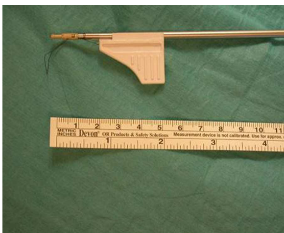
Figure 4 Image of the 2.8 mm PopLok knotless bone anchor device (ConMed®, USA).