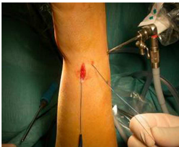
Figure 3 Entry and exit of the 3/0 monofilament thread by the 6 R and accessory portals.