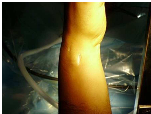
Figure 1 6 R and accessory arthroscopy portals, located between the anterior and posterior ulnar tendons, with the upper limb suspended on a traction tower.

Once the diagnosis and therapeutic indication had been established, we created an accessory portal to 6 R, between the anterior and posterior ulnar tendons (Fig. 1). We introduced the instrumentation through this portal and, under direct visual control, identified the point selected to reanchor the TFC in the ulnar fovea. This point was first marked with a guide needle, then drilled with the drill bit of the device, and then verified radiographically. We also used the same approach to pass a monofilament 3/0 thread by the TFC (Fig. 2a and b) following the outside-in technique (Fig. 3). This thread was subsequently replaced by the 0/0 thread of the anchor system. We loaded the 2.8 mm PopLok implant (ConMed®, USA) (Fig. 4), placed in its foveal location and tensed without traction (Fig. 5) and verified the stability of the reanchor. We then proceeded to close the