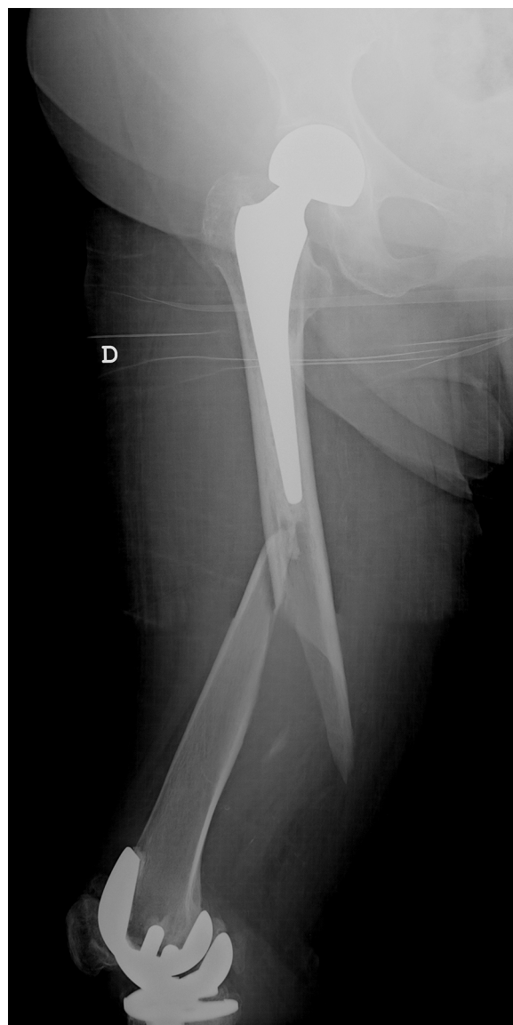
Figure 1 Interprosthetic diaphyseal fracture type IA.

Interprosthetic fractures are rare in orthopaedic surgery departments, therefore publications referring to them are