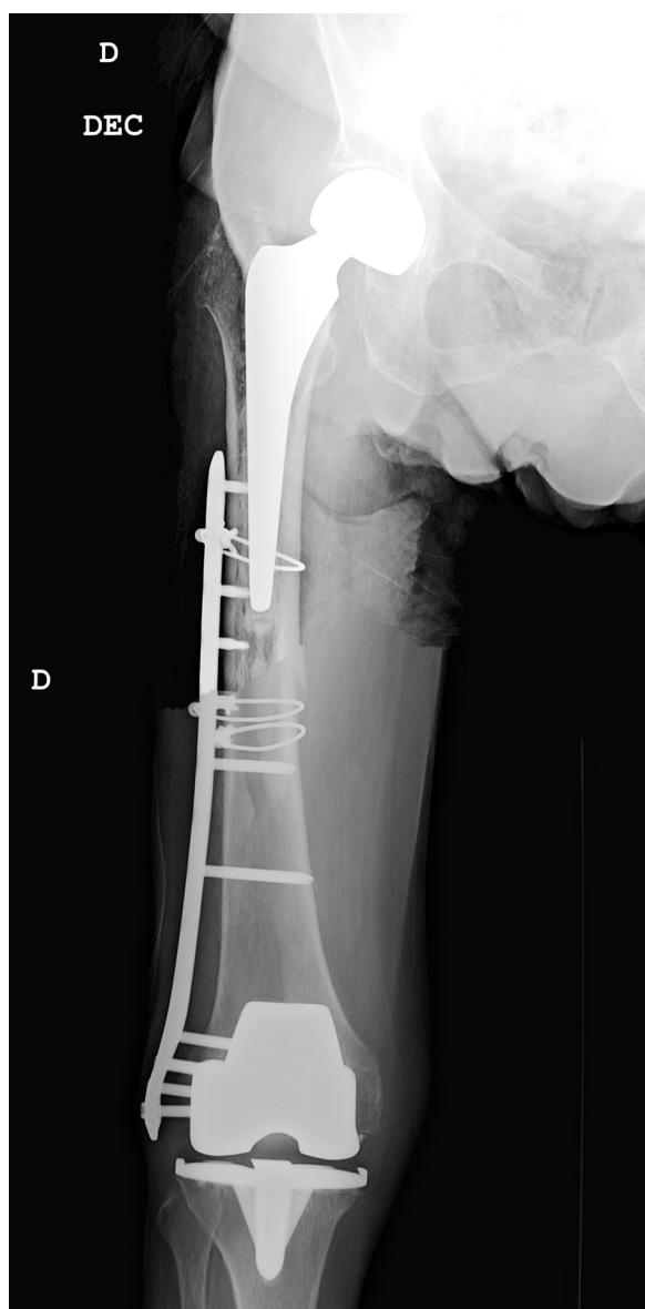
Figure 2 Osteosynthesis with lateral plate stabilised with screws and cerclage. Insufficient overlap of the plate with satisfactory outcome.

Interprosthetic femoral fractures. Treatment with an angular-stable plate. PS: posterior stabilised; UC: ultracongruent.