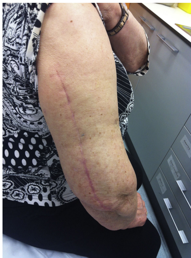
Figure 2 Healing of modified posterior approach.

The patient is placed in a lateral decubitus position with the affected limb on a support and the elbow flexed at 90 degrees. A longitudinal incision is made in the posterior region of the arm, the length will depend on how proximal the fracture is, and is prolonged up to the olecranon