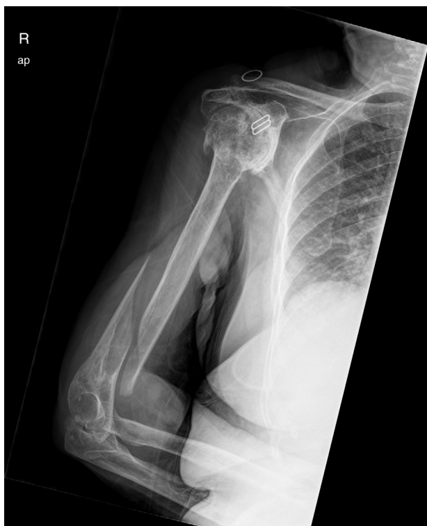
Figure 1 Extra-articular distal-third diaphyseal fracture of the humerus.

comprised 13 women and 10 men, with a mean surgical intervention age of 45; 14 fractures were of the left humerus and 9 of the right, 11 of them in the dominant arm. The causes of the fractures were 9 casual falls, 3 bicycle accidents and 4 motor cycle accidents, 3 falls from a height, 2 road accidents (getting run over), one sports accident (snowboard) and one crush injury. The fracture pattern was classified in accordance with the AO/OTA classification and resulted in: 6 12-A fractures (26%), 7 12-B fractures (30%) and 10 12-C fractures (44%). Mean follow-up was 17.7 months. None of the fractures were open nor derived from vascular injuries. The rate of radial palsy prior to surgery was 39.1% (9 patients).