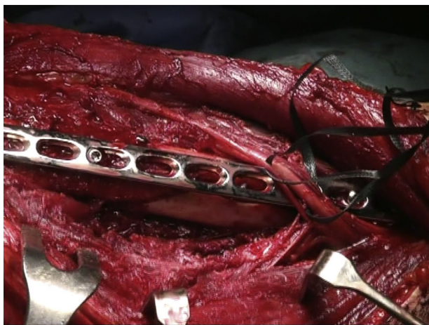
Figure 5 Trajectory of the nerves over the plate.

compression interfragmentary osteosynthesis is performed, if the fracture can withstand it. In all cases the 3.5 mm LCP extra articular preformed distal humerus plate was used (DePuy Synthes, West Chester, PA, U.S.A.). The plate was centred on the posterior side of the humerus diaphysis and against the posterior cortical surface of the humerus, below the radial nerve (Fig. 5), with distal prolongation positioned in the external pillar (Fig. 6). It is important when positioning the plate to use radioscopy to ensure it is not too long in the distal region, as this may lead to pinching in the joint and subsequent discomfort and pain on extending the elbow. After ensuring that intraoperative radioscopic