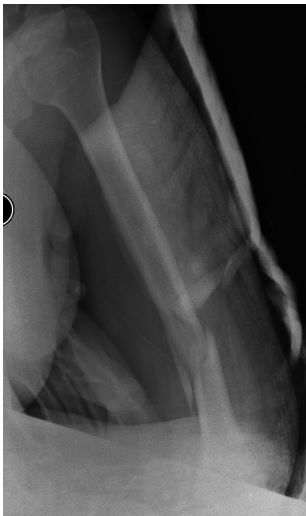
Figure 7 Extra-articular distal-third diaphyseal fracture of the humerus.

It is true, however, that with the latter there is a risk of iatrogenic radial palsy and infection and therefore re-intervention. Other authors state that surgical treatment reduces soft tissue complications compared with conservative treatment. 1