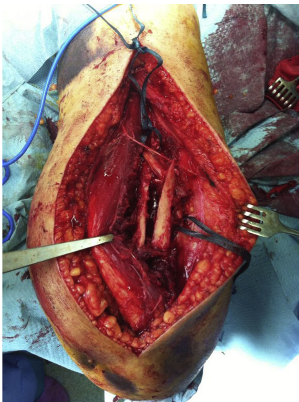
Figure 4 Fracture site with entrapped radial nerve.