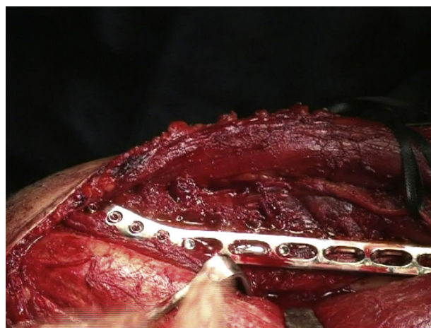
Figure 6 Distal plate extension in the external humeral column.

compression interfragmentary osteosynthesis is performed, if the fracture can withstand it. In all cases the 3.5 mm LCP extra articular preformed distal humerus plate was used (DePuy Synthes, West Chester, PA, U.S.A.). The plate was centred on the posterior side of the humerus diaphysis and against the posterior cortical surface of the humerus, below the radial nerve (Fig. 5), with distal prolongation positioned in the external pillar (Fig. 6). It is important when positioning the plate to use radioscopy to ensure it is not too long in the distal region, as this may lead to pinching in the joint and subsequent discomfort and pain on extending the elbow. After ensuring that intraoperative radioscopic