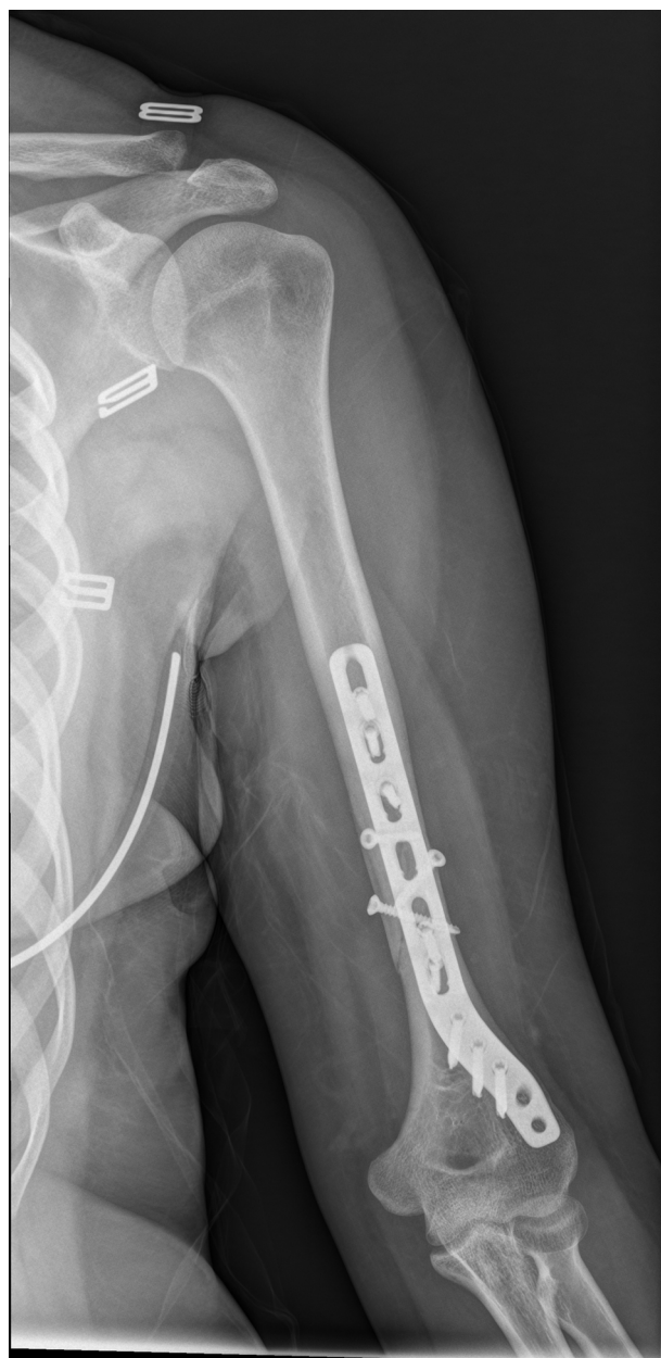
Figure 8 Result of X-ray 2 weeks after surgery.

Different approaches have been proposed over the years for this type of fracture, from a posterior trans-tricipital approach to a lateral approach, and even percutaneous synthesis, obtaining varied outcomes depending on the series with regard to iatrogenic damage to the radial nerve. In 1996 Gerwin et al., described a posterior approach which had not been much used up until that time. It consisted in finding the lateral brachial cutaneous branch of the radial nerve, and continuing along its length to reach the radial