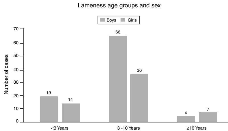
Figure 1 Distribution of cases of lameness in the PED according to age group and sex.