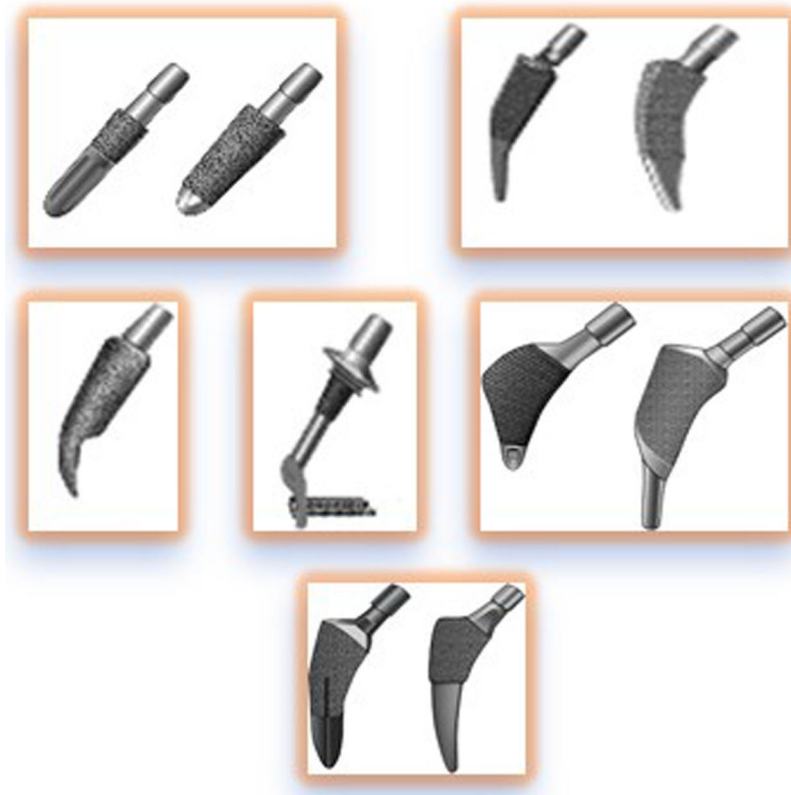
Figure 3 The types of short stem proposed by Khanuja et al. 69

but shorter in length, with the aim of solely metaphysary anchorage in the proximal femur (Fig. 3).