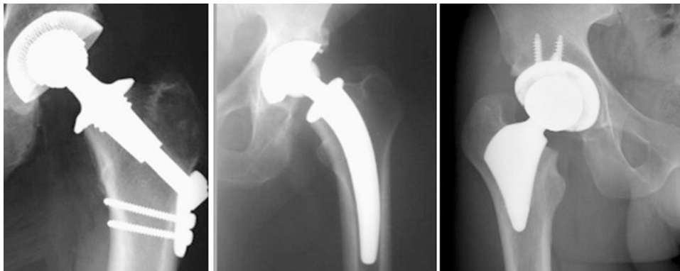
Figure 2 X-ray appearance of types of short stem, according to Learmonth. 64

They classify them into 4 large groups which, in turn, are sometimes classified into subgroups: type 1 A, prosthesis supported exclusively on the trapezoid cross-section neck; type 1 B, prosthesis supported exclusively on the neck with a rounded geometry and with strias for rotational stability; type 1 c, prosthesis supported exclusively on the neck with spiral geometry for rotational stability; type 2 A, prosthesis that applies load to the trapezoid cross-section calcar and with a wedge design; type 2 B, prosthesis that applies load to the rounded cross-section calcar with preservation of the femoral neck; these may also have strias; type 2 C, neck preservation stem with threaded anchorage on the lateral metaphysary cortex; type 2 D, thrust plate or screw-plate design that compresses the calcar against the external cortical metaphysary; type 3, rods with lateral trochanteric expansion, and type 4, a stem with a conventional design