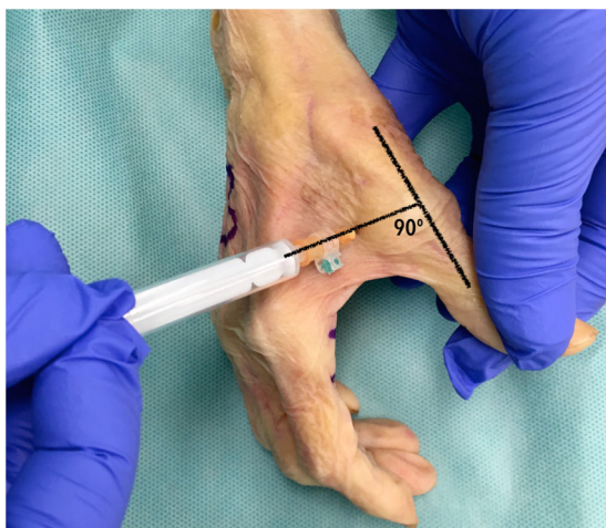
Figure 1 Dorsal ulnar injection performed in each thumb at the metacarpophalangeal joint keeping the thumb in maximum abduction, directing the needle towards the subcutaneous cellular tissue at the level of the first metacarpal head at a 90° angle to the thumb axis.