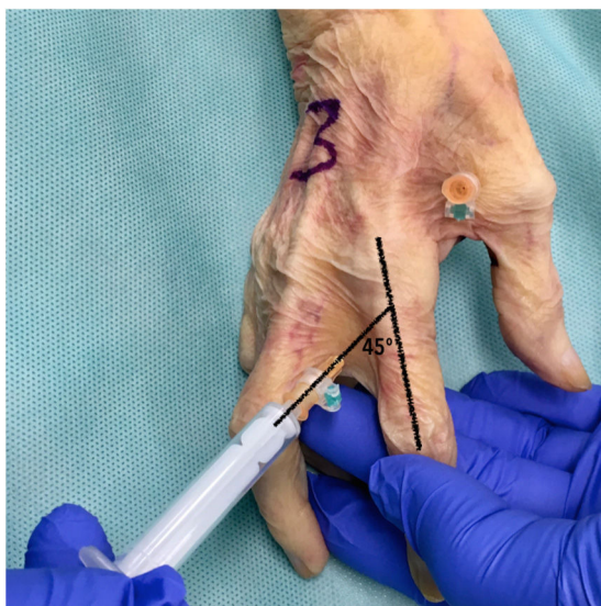
Figure 2 Injection through the dorsal web performed in each finger keeping the metacarpophalangeal joint slightly flexed and directing the needle towards the metacarpal head at a 45° angle to the finger axis.

(approximately 30°) and directing the needle towards the subcutaneous cell tissue at the head of the metacarpal at a 45° angle to the finger axis (Fig. 2). One ulnar dorsal injection was performed in each index finger, one ulnar dorsal and one radial dorsal injection in each middle and ring finger, and one radial dorsal injection in each little finger.