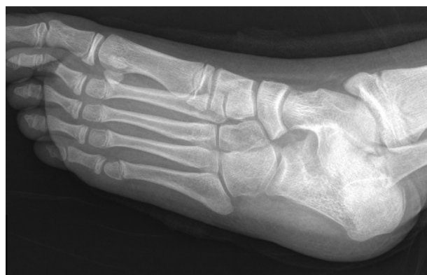
Figure 3 Radiological control after surgery.

After inserting the arthroscope into the viewing portal, we proceed to the tarsal sinus. We then make the working portal and with straight mosquito forceps dissect the subcutaneous tissue over the coalition, heading towards the tarsal sinus until we locate the optic camera. Alternatively, with a synoviotome and a vaporiser, we go upwards from the tarsal sinus through the anterior calcaneal tuberosity, delineating the coalition until we reach the body of the navicular. We perform the resection with an electric bone drill of 5 mm. When starting the resection, the joint between the talar head and the navicular appears and from there we progress in depth to resect the entire coalition until confirming that the navicular and calcaneus move independently. The joint between the calcaneus and cuboid is exposed and between the astragalus and navicular on the other side.