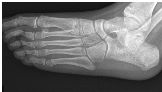
Figure 1 Radiological image (oblique projection of the coalition).

We performed a retrospective study of all patients undergoing calcaneonavicular coalition surgery performed endoscopically in our hospital from 2015 to 2018. The inclusion criteria were persistence of symptoms (pain, repetitive sprains and stiffness) and limitations to daily activities after conservative treatment for at least six months. Epidemiological variables such as age and sex were collected. For