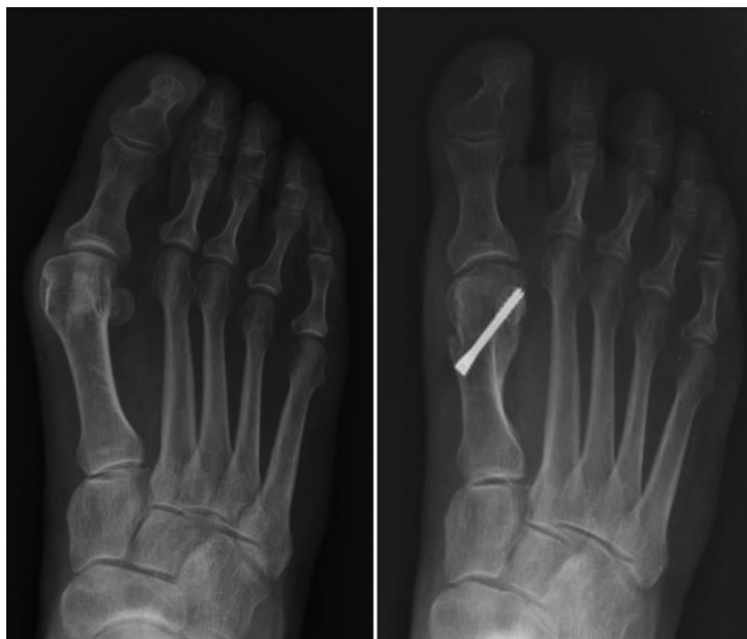
Fig. 2 Follow-up at one year following Bösch osteotomy.