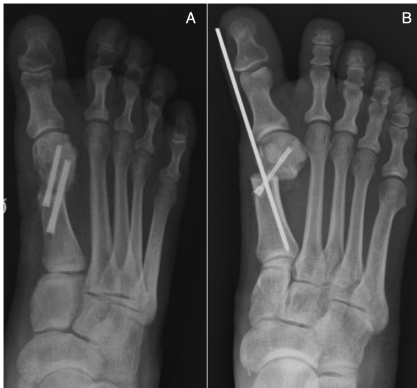
Fig. 1 A) Percutaneous Chevron osteotomy, fixation with two screws. B) Bösch osteotomy with screw and Kirschner wire placement.