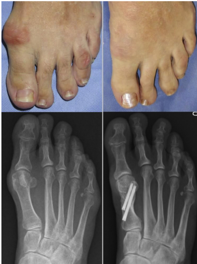
Fig. 3 Follow-up at one year following percutaneous Chevron osteotomy.