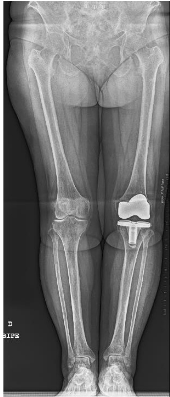
Figure 3 Postoperative X-ray image.

It is important to be fully aware of tissue involvement during surgery. In our case we saw that cartilage as well as tendons and ligaments were affected by black colouration (Fig. 2). The femoral condyle and medial tibial plateau showed major degeneration, with involvement up to the subchondral bone, although at this level no macroscopic