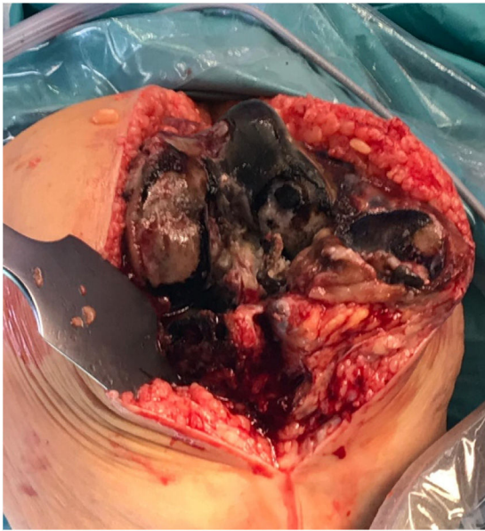
Figure 2 Intraoperative appearance of pigment-impregnated tissues.

tional examination by X-ray was completed using telemetry, showing correct alignment of the operated limb and correct implant position (Fig. 3).