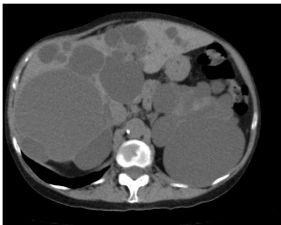
Fig. 3 – CT: polycystic liver disease.

(75%) have palpable hepatomegaly. 54,61,62 Stigmata of liver disease and acute liver failure are rare. 60,77