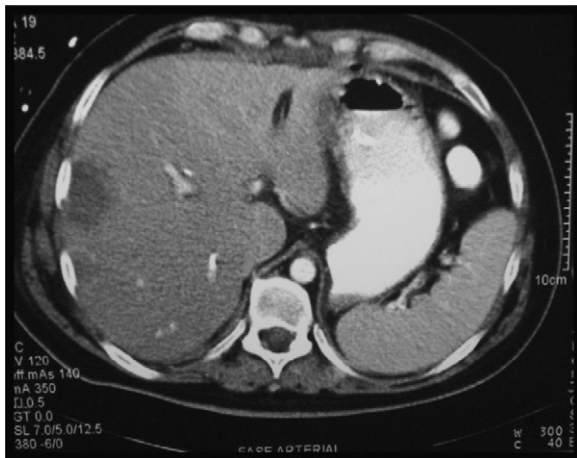
Fig. 2 – CT scan performed after re-operation to suture the ruptured right hepatic artery. Necrosis of the right hepatic lobe.

crossing this bile duct is injured. 17,18,27-33 The RHA may be clipped, sectioned or cauterised, either by being confused with the cystic artery or during bleeding episodes when performing haemostasis blindly. After conversion to laparotomy, total stitching in the liver hilum can be implemented, injuring the common bile duct and/or hepatic hilar vessels. 26 Late RHA injury is seen as pseudoaneurysms or rupture of this artery, which often causes haemobilia or gastrointestinal or intraperitoneal bleeding, 28,40-42 as in our patient who presented with a haemobilia and haemoperitoneum with haemodynamic instability. The pathogenesis of the pseudoaneurysm causing arterial rupture is unknown. It may be related to the possible intraoperative injury of the RHA wall by diathermy leaving it devitalised, 42,43 or due to a fungal infection 44 eroding the arterial wall. Occasionally, the arterial injury may be more severe and affect the CHA. 25,26 Less common is the combination of portal and arterial injury, but is of greater clinical severity. 18,26,28-30 Portal and biliary injury, without arterial injury, is less common.