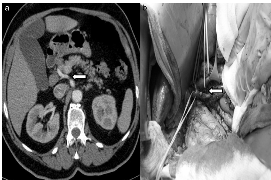
Fig. 3 – (a) Multi-slice computed tomography showing evidence of common hepatic artery originating from the superior mesenteric artery; (b) intraoperative image of the common hepatic artery originating from the superior mesenteric artery.

The greater precision for evaluating the tumor resectability of MSCT is due to its higher resolution and ability to create multiplanar reconstructions. The disadvantages it presents include the need for work stations, training for radiologists and sufficient time (which is often impossible due to the excessive amount of work) to create multiplanar and volumetric reconstructions. 9-12