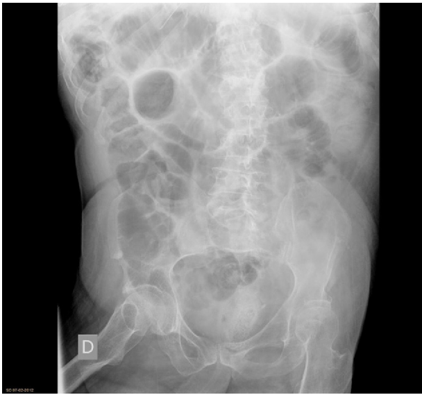
Fig. 2 – Initial image of intestinal obstruction due to adhesions.

protocol and management is determined by the characteristics of each case.