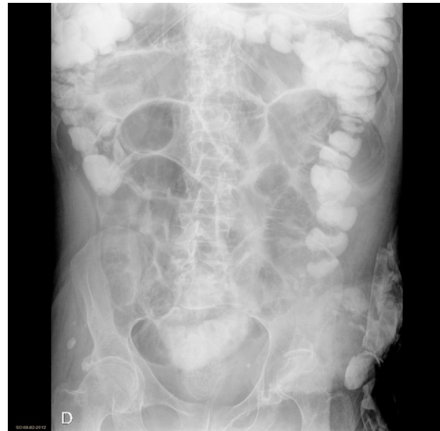
Fig. 3 – Intestinal obstruction after the administration of Gastrografin® with resolution of symptoms.

As recorded in the medical files of the 164 patients, 105 (64.6%) had undergone lower abdominal surgery, 25 (40%) had a single previous surgery and only 4 patients out of the 164 (2.4%) had had prior laparoscopic surgery (Table 2).