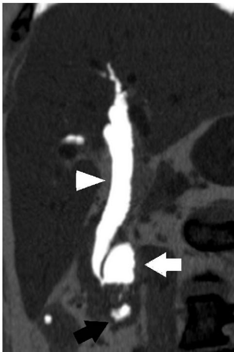
Fig. 1 – Multidetector computed tomography; oblique multiplanar reconstruction at minimum intensity projection showing air in the common bile duct (white arrowhead), juxtapaillary duodenal diverticulum (white arrow) and horizontal portion of the duodenum (black arrow).

The point of least resistance in the duodenal wall is at the ampulla of Vater because it is at this point where the circular configuration of the duodenal musculature becomes less structured in order to integrate with the sphincter of Oddi. It is assumed that this is why most duodenal diverticula appear in the juxtapaillary region, and may even encompass the papilla. 2 Whether the presence of a JDD conditions significant dysfunction at the sphincter of Oddi is still controversial since there are contradictory manometric studies in the literature. 5,6 There is no evidence of local histologic fibrous or inflammatory changes, 4 nor has any specific association been reported between JDD and neoplastic disease. 7