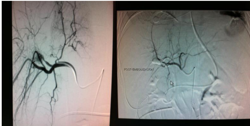
Fig. 2 – Pseudoaneurysm filled by branches of the right hepatic artery (arteries of segments VII and VIII). Endovascular coil embolization was performed. Right image: arteriography where no evidence of contrast leak is observed after embolization.

duct, which quickly passed to the subhepatic bed and the abdominal drainage catheter. A 7Fr/12 cm plastic prosthesis was inserted distal to the lesion.