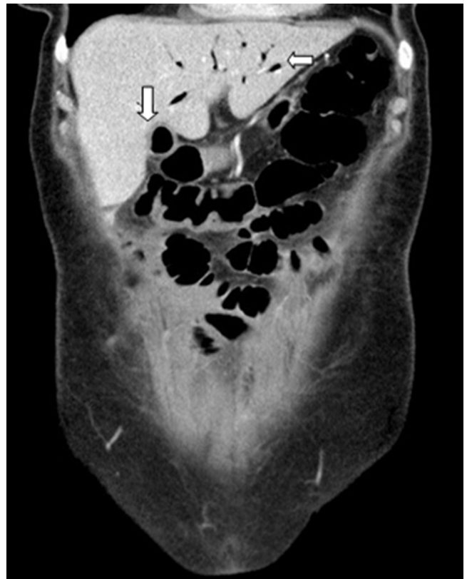
Figure 3 – Coronal CT reconstruction showing a cholecysto-duodenal fistula and pneumobilia.

loops with air-fluid levels (Fig. 1A and B). Three of these four cases underwent abdominal computed tomography (CT) (patients 1, 4 and 5). In all the cases, CT scans showed pneumobilia and a calculus that was causing the intestinal obstruction (Fig. 2) and confirmed the diagnosis. In all three cases, coronal CT reconstruction demonstrated a cholecysto-