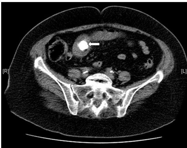
Figure 2 – Axial CT cut showing the presence of an impacted calculus in the small intestine.

loops with air-fluid levels (Fig. 1A and B). Three of these four cases underwent abdominal computed tomography (CT) (patients 1, 4 and 5). In all the cases, CT scans showed pneumobilia and a calculus that was causing the intestinal obstruction (Fig. 2) and confirmed the diagnosis. In all three cases, coronal CT reconstruction demonstrated a cholecysto-