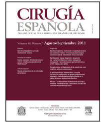
Image of the month