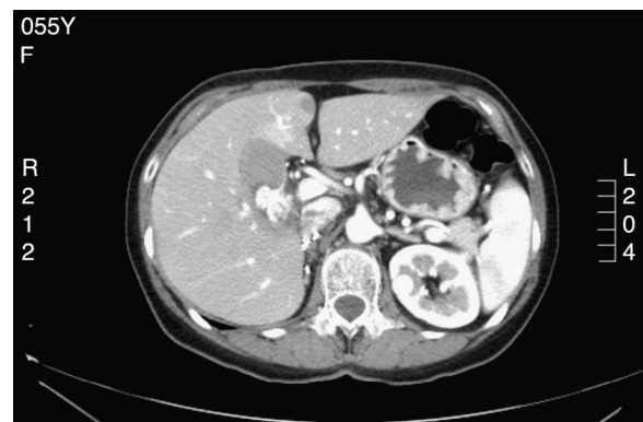
Fig. 1 – CT image showing the hypervascular polypoid lesion of the gallbladder with purging measuring approximately 2 cm in diameter, highly suggestive of a neoplastic process.

After the radical treatment of the gallbladder metastasis, the patient underwent oncologic surgery of the contralateral kidney metastasis by the urology department.