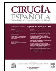
Image of the month