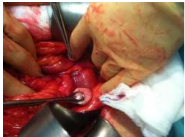
Fig. 1 – Surgical field: above the swab, a perfect seal of the sigmoid perforation is observed; there is no local or general peritonitis.

After an evident iatrogenic perforation of the colon treated with an Ovesco® clip, there is dilemma about the need