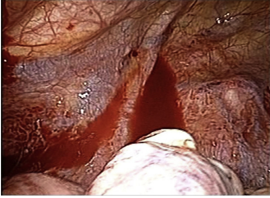
Fig. 2 – Exploratory thoracoscopy showing evidence of ampullae in the left apex.

surgery. As in the general population, thoracoscopy is the surgical approach of choice.