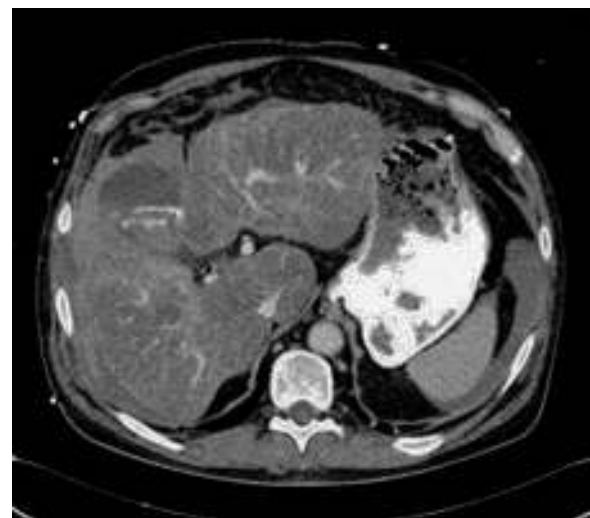
Fig. 1 – Abdominal CT scan: hyperdense perihepatic fluid; distended gallbladder and active extravasation of contrast material in its interior.

Involved in the aetiology are gallstones (50% of cases), anticoagulation, 5 antiaggregation or coagulopathies, gallbladder cancer, trauma, portal hypertension, corticosteroid therapy, blood dyscrasia, ectopic gastric or pancreatic mucosa and parasites. 6