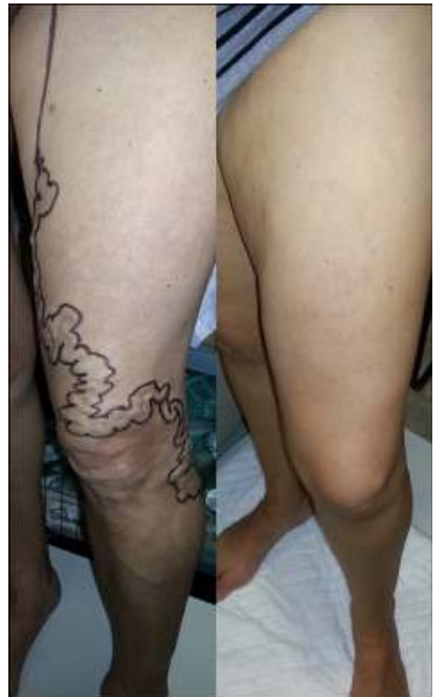
Fig. 2 – One-year results after surgery: image showing varicose tributaries of the AASV; the left image shows the preoperative mapping, and situation 12 months after surgery is on the right.

Three (5%) haematomas were detected, none of which required surgical treatment. There were no deaths, hospitalisations, deep venous or symptomatic superficial thromboses, infections or episodes of neuritis. Early ultrasound tests detected 7 (11%)