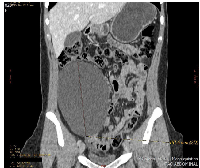
Fig. 1 – Computed tomography scan showing the retroperitoneal cystic mass in the right anterior renal region measuring 16 cm×12 cm×6 cm, with homogenous density.

After the clinical and radiological findings, and given the malignant potential of these masses, immediate surgery is important since invasive diagnostic methods like fine needle aspiration are not sensitive enough to rule out malignancy, and tumor markers are normal in most cases. 2,8