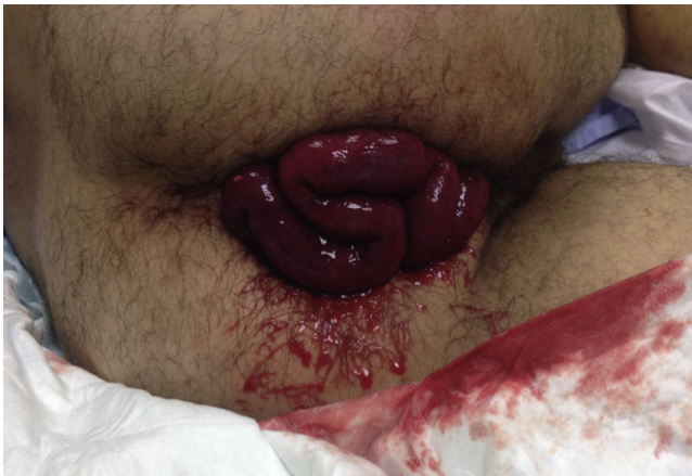
Fig. 1 – Transanal evisceration of the small bowel in the emergency room.