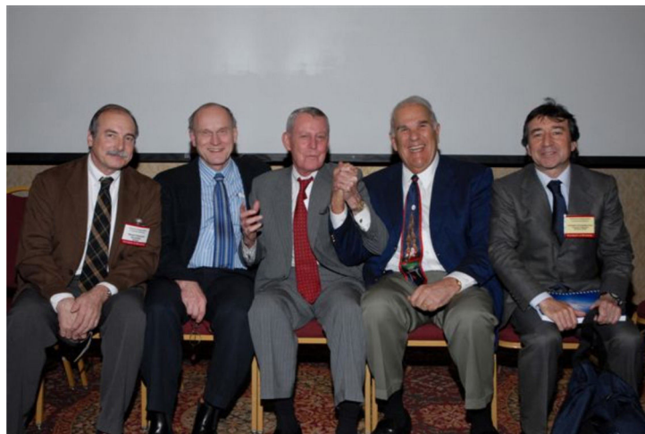
Fig. 6 – At the 40th anniversary of the first pancreatic transplantation: D. Casanova, D. Sutherland, T. Starzl, J. Najarian, L. Fernández-Cruz.

As long as we do not have procedures for the prevention of diabetes, the solution for diabetic patients with risk of secondary complications will entail the replacement of functioning islet tissue by transplantation. Answers for this substitution are likely to involve cell transplantation in the future, but it is unquestionable that, after 50 years of progress, the fulfillment of these objectives involves vascularized