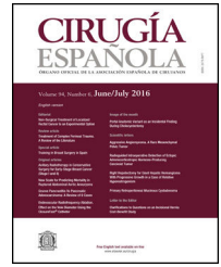
Image of the month