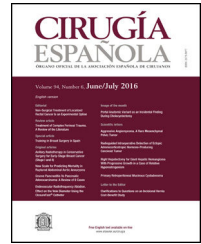
Image of the month