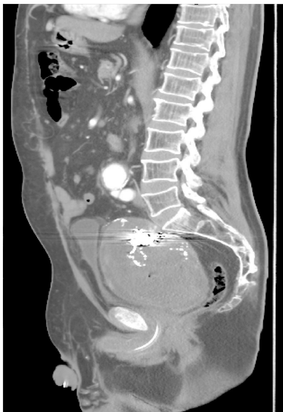
Fig. 1 – CT: aneurysm of the hypogastric artery compressing the rectum (sagittal view).

clinical symptoms of constipation and intestinal obstruction secondary to extrinsic compression of the colon or rectum by a vascular mass are extremely rare.