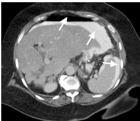
Fig. 1 – Abdominal computed tomography showing pneumoperitoneum and free peritoneal fluid with evidence of leaked contrast medium (arrows). Given these findings, the patient underwent emergency laparoscopy.

Single anastomosis duodeno-ileal bypass with sleeve gastrectomy (SADI-S) was introduced by Sanchez-Pernaute et al. in 2007 for super-obese patients (BMI > 50 kg/m 2 ). 1 This procedure reduces complications and surgical time, but if an anastomotic leak (AL) occurs, it can be difficult to diagnose and treatment ranges from conservative measures to re-operation. 2,3 There are very few published cases of AL after SADI-S. 2,4 We present a technical option of how to surgically resolve an AL after this procedure. The patient is a 60-year-old woman with a BMI of 55 kg/m 2 , personal history of type 2 diabetes and obstructive sleep apnea syndrome. Four days earlier, she had undergone a laparoscopic SADI-S procedure at another hospital, with no complications during the hospital stay. Upon arrival at our emergency room, she presented hypertension, tachypnea, malaise and progressive abdominal pain. She reported no fever, nausea or vomiting. Laboratory tests were normal, except for C-reactive protein: 90 mg/L (reference values: 0–8.0 mg/L). Computed tomography (CT) scan with oral contrast demonstrated pneumoperitoneum and peri-hepatic and peri-splenic free fluid (Fig. 1). We decided to perform urgent laparoscopy, finding diffuse peritonitis. The AL site was identified on the posterior side of the duodeno-ileal anastomosis. The defect was closed with absorbable