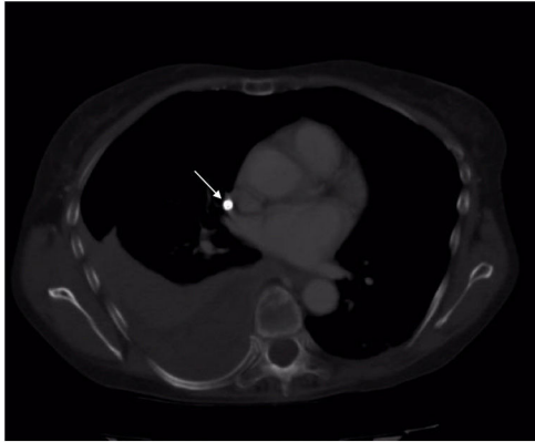
Fig. 1 – Thoracic CT angiogram with extravasation of the central venous catheter (arrow) and associated hemothorax.

plication, especially when the SVC is compromised. To prevent these complications, ultrasound-guided catheter insertion has been shown to increase the safety of the procedure. 2,3