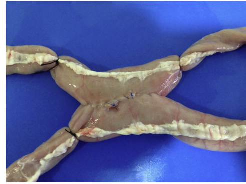
Fig. 2 – Side-to-side laparoscopic anastomosis with ex vivo cryopreserved viscera.

stitches. It is a dichotomous variable with two tension levels: correct or incorrect.