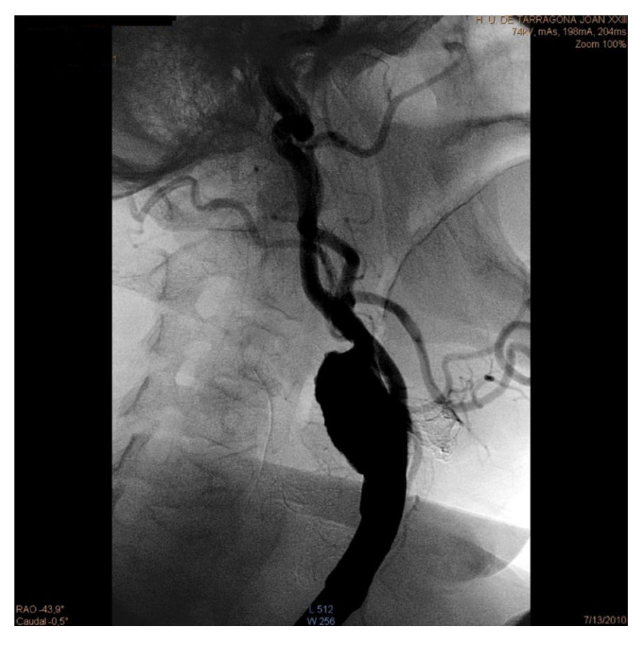
Figure 2 Selective left carotid arteriography.

The abdominal CTA confirmed the presence of an infrarenal AAA, of 4.5 cm maximum size, with elongation of common iliac arteries. It also revealed the presence of hepatosplenomegaly with ascites and mediastinal and abdominal lymph node formations. The patient presented ankle-brachial indices of 1 on the right side and 0.86 on the left. Finally, the SAT ultrasound found an ectasia in the right distal internal carotid and a true aneurysm of 4 cm maximum diameter at the level of the carotid bulb, extending into the left proximal internal carotid, with a mural thrombus in its interior.