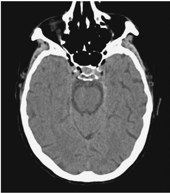
Figure 2 Air collections at the level of both cavernous sinuses.

grade pathway by the venous circulation, depending on the size of the bubbles, the diameter of the catheter and the ejection fraction. 9,10 Air embolism ischaemia is caused by several mechanisms: obstruction of blood flow, vasospasm and thrombus formation by platelet activation. The temporal relationship between the procedure and the stroke facilitates its diagnostic suspicion. Neuroimaging tests must be carried out immediately to detect the presence of gas;