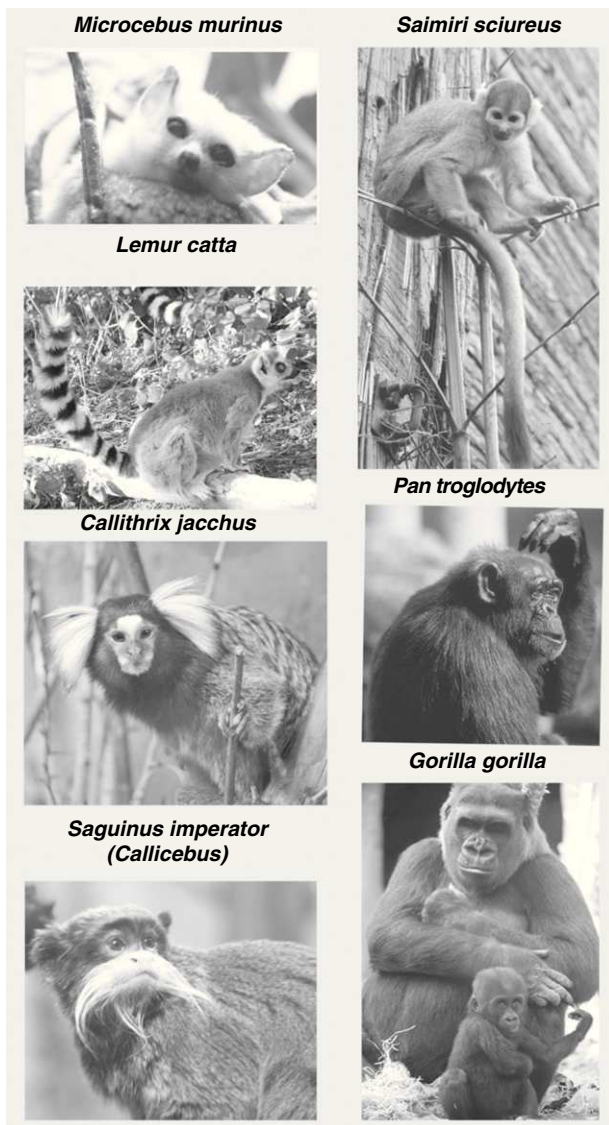
Figure 3 Images of non-human primates: Microcebus murinus (mouse lemur), Lemur catta (ring-tailed lemur), Callithrix jacchus (common marmoset), Saguinus imperator (tamarin), Saimiri sciureus (squirrel monkey), Pan troglodytes (chimpanzee) and Gorilla gorilla (gorilla).

infectious disease prevention are especially important for geriatric animals in captivity. Sanitary conditions, presence of predators and availability of food and water are especially important for wild animals in different habitats. If calculating life span is problematic, calculating the cut-off point between maturity and senility is more so.