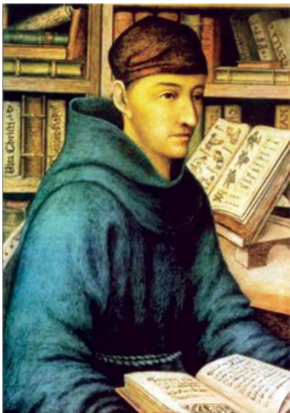
Figure 4 Fray Bernardino de Sahagún

during which Psilocybe specimens are ingested a pair at a time must comply with a series of precepts, including fasting and abstinence from sex and alcohol. The ritual takes one night to perform and mushrooms must be placed on an altar and purified with tobacco and incense. This will let the shaman diagnose and treat participants' illnesses.