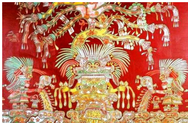
Figure 3 Tepantitla mural. Priests bearing psilocybin mushrooms around the god Tlaloc.

The consumption of hallucinogenic mushrooms in ritual ceremonies was widespread among Mesoamerican cultures. Religious practices with sacred mushrooms extended from the Valley of Mexico to the rest of Central America, and they are thought to be at least 3500 years old. The Maya consumed k'aizalaj Okox ( Psilocybe cubensis ), known to the Aztecs as teonanácatl . These mushrooms were also consumed by the Huastec, Totonac, Mazatec, and Mixtec peoples. Since prehistoric times, the people of Teotenango have had the custom of grinding mushrooms with water on models of temples that were to be constructed, or on stones marked with petroglyphs. Furthermore, archaeological evidence points to mushroom use in Mexico, Guatemala, Honduras, and El Salvador, where the 'mushroom stones' carved to represent hallucinogenic mushrooms have been found. In Kaminaljuyú, Guatemala, researchers found 9 mushroom stones whose stalks are decorated with anthropomorphic figures demonstrating the pre-Hispanic custom of grinding sacred mushrooms into powder.