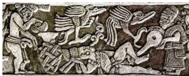
Figure 2 Mayan ritual enema

‘‘They also adored and attributed divine power to the herb they call piziet, which is tobacco; their custom is to imbibe the smoke, and thus inebriated, they will invoke the devil to learn about the future and pass on the pleas and wishes commended to them by others. We understand that