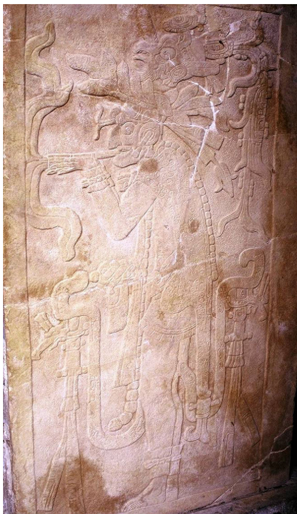
Figure 1 Temple of the Cross, Palenque. Ceremonial tobacco use.

Vindobonensis shows richly dressed figures drinking pulque. The mural known as ‘The Drinkers’ in Cholula, Puebla (Mexico), shows male and female figures drinking pulque in a group ceremony. 5