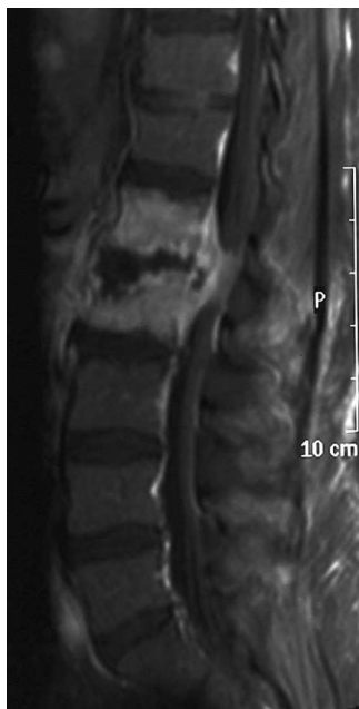
Figure 2 L1-L2 spondylodiscitis due to S. agalactiae with epidural abscess and spinal cord compression. Sagittal spinal MRI, T1-weighted sequence after gadolinium injection.

disease. In addition, three patients (42.9%) had tumours and two (28.6%) had diabetes. Furthermore, five (71.4%) of the seven patients presented breaks in the skin barrier that may have favoured invasive infection by skin bacteria: skin ulcers (two patients), CSF fistula, intravenous