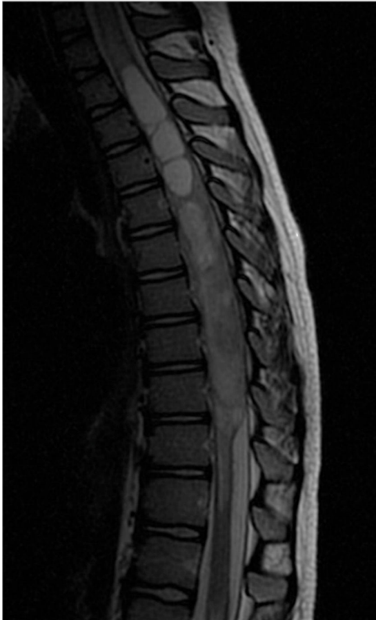
Figure 1 Craniomedullary magnetic resonance imaging study. Sagittal T2-weighted sequence before contrast administration showing an intramedullary tumour from D5 to D9, and syringomyelia proximal to the tumour.

characteristics, a spinal MRI should be performed to rule out compressive diseases of the spinal cord, such as traumatic lesion, haemorrhage, intramedullary abscess, tumour, and transverse myelitis. 1,5–7 In our case, the diagnosis of GBS was doubtful because of presence of abdominal pain radiating to the lumbar region at symptom onset, bladder symptoms, the asymmetric pattern of weakness, and absent cremasteric and abdominal reflexes. These symptoms led doctors to the