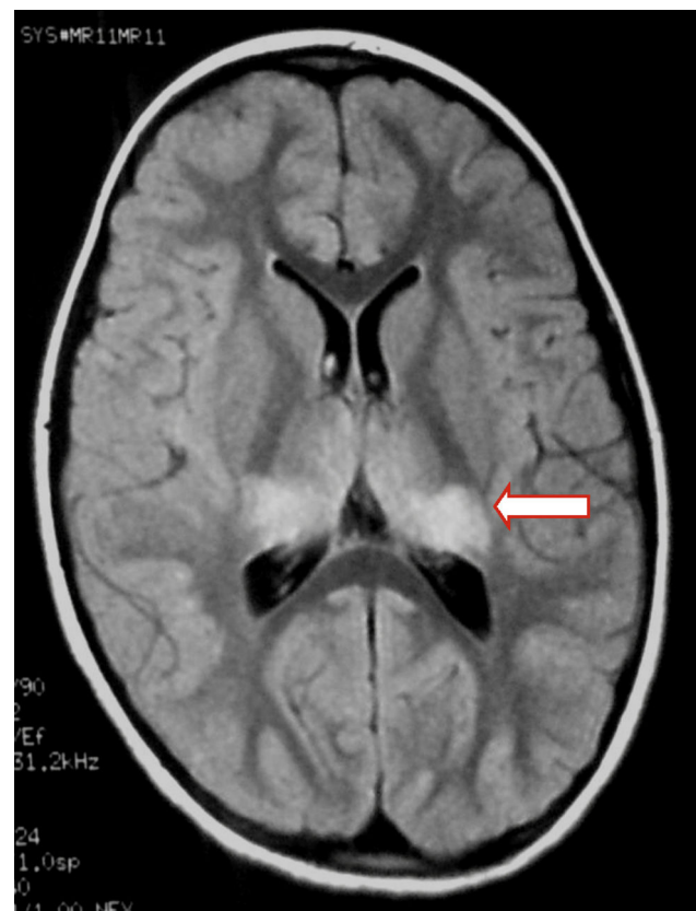
Figure 1 Axial FLAIR MR image: bilateral thalamic hyperintensities.

somnolence, and gait abnormalities. She had a normal level of consciousness, generalised hyperreflexia, cerebellar ataxia, and no meningeal signs. A laboratory test revealed leukocytosis (25 300 leukocytes/mm 3 ; 60% neutrophils) with no activated lymphocytes and no heterophile antibodies (Paul-Bunnell test). A CSF cytochemical test showed 20 red blood cells/mm 3 , 40 leukocytes/mm 3 (60% polymorphonuclear), glucose level of 0.45 g/L, and a total protein level of 0.46 g/L. The bacteriological study revealed no abnormalities. Polymerase chain reaction (PCR) testing was positive for EBV and negative for enterovirus and herpesviruses 1, 2, and 6. A cranial CT scan revealed no abnormalities and the EEG displayed diffuse cortical and periodic subcortical activity. A brain MRI scan revealed T2-weighted and FLAIR hyperintensities at the level of the thalamus, midbrain, and cerebellum. No contrast uptake or diffusion restriction was seen (Figs. 1 and 2).