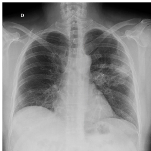
Figure 1 Chest radiography showing right lower lobe opacification and left lingula consolidation.

testing was negative for SARS-CoV-2 in nasopharyngeal exudate but positive in sputum. A chest radiography showed right lower lobe opacification and lingula consolidation; these findings were confirmed by a chest CT scan and linked to the infection (Figs. 1 and 2). More detailed analyses showed normal kidney, liver, and thyroid function; vitamin B 12 and folate levels within normal ranges; and normal lipid profile, blood count, and coagulation profile. Autoimmune tests yielded negative results except for antinuclear antibodies (1:320, homogeneous pattern) and acetylcholine receptor antibodies (1.10 nmol/L; positive: >0.20 nmol/L). Serology tests were negative. Diplopia resolved the day after hospital admission. A head CT scan