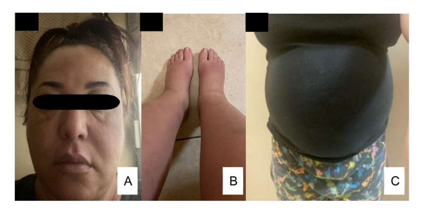
Figure 1 Facial edema (A), lower limbs edema (B), thorax and abdomen edema (C).

Pregabalin's mechanism of action is binding to the \alpha2\delta subunit of presynaptic voltage-gated calcium channels in presynaptic neurons, thereby reducing the release of the excitatory neurotransmitter glutamate.<sup>4</sup> Peripheral edema and worsening of heart failure symptoms have been reported with the use of pregabalin for neuropathic pain.<sup>4,5</sup> These effects may be the result of the antagonism of L-type calcium channels in the vasculature causing vasodilation, similar to the mechanism of calcium channel blockers used to treat hypertension.<sup>4</sup> L-type calcium channels are widely distributed in the smooth muscle cells of peripheral arteries, their blockage dilates the systemic vasculature, substantially reducing blood pressure and may cause edema. In this