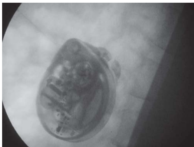
Fig. 2 – Leaking in the system at pump connection (oblique view).

a spinal puncture and the patient receive 50 µg intrathecally of baclofen as a bolus with complete resolution of his symptoms. He was taken that evening to the operating room for an exploration of his pump. Initially the abdominal site was explored, fluid was found around the pump. The system connection was change to 8709SC connector, and pump was repositioning. An increase in dose of baclofen to 550 µg/day. He quickly returned to his baseline level of function, his spasticity improved dramatically. He was discharged home on postoperative day one and on follow-up, he continued to do well.