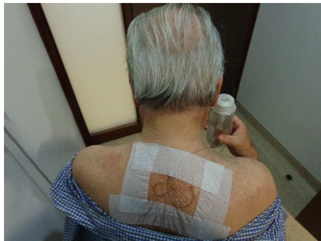
Fig. 4 – Cervical epidural tunneled catheter.

infusion was then started using an elastomeric pump with 250 mL of 0.9% SS + 50 mL of 0.75% levobupivacaine; the pump offered the possibility of using three different fixed infusions – 3, 4 and 6 mL/h. The infusion rate selected was 2 mL/h. One day later, pain was rated as 5/10 on the VAS. The infusion rate was increased to 4 mL/h and 6 mL/h during crisis periods. During two days of the infusion period, 300 µg of clonidine were added to the preparation for delivery at a rate of 6 µg/h, and 500 mg of ketamine were added during the last two days for delivery at a rate of 10 mg/h. The patient continued to receive the epidural infusion for a total of 16 days on an outpatient basis, with follow-up visits to the clinic every two days and pump refill; during this time, pain remained under control (0–3/10 on the