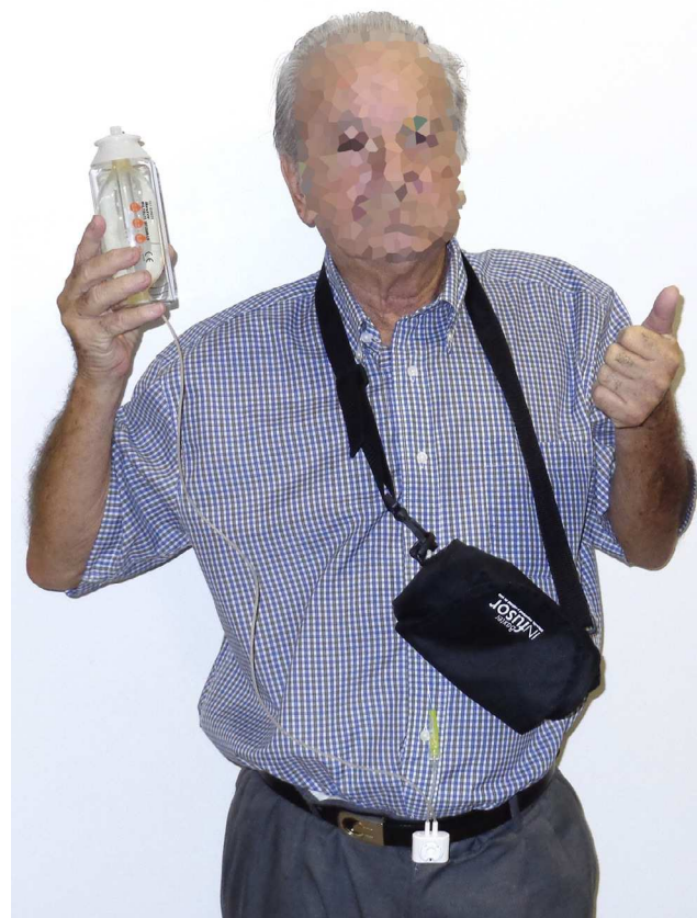
Fig. 5 – Elastomeric pump for cervical epidural infusion.