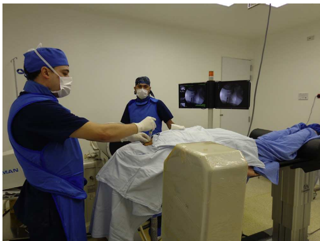
Fig. 2 – Cervical epidural injection in prono guided by fluoroscopy.