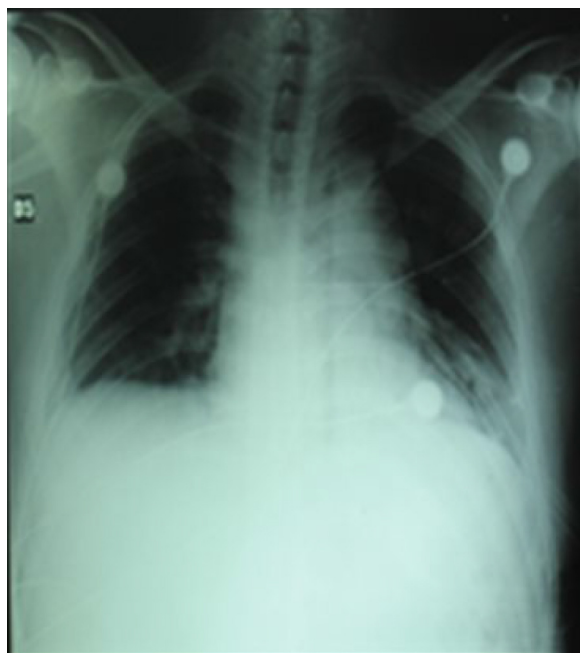
Fig. 2 – Chest X-ray at admission.