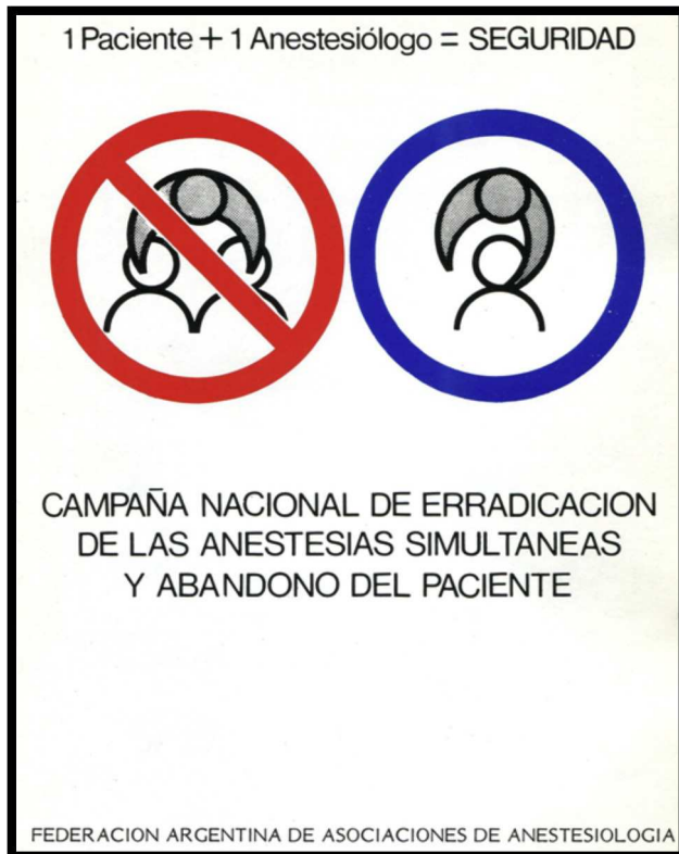
Fig. 2 – National Campaign Against Simultaneous Anaesthesia. Mendoza Association of Anaesthesiology, 1987.

(personal communication) there are close to 1400 anaesthetists and 11.14 million inhabitants (1 anaesthetist for every 8000 people), and in Havana, the capital city, there are 420 anaesthetists to serve 2 million inhabitants (1 for every 4761 inhabitants). In Argentina, according to Weissbrod EP, member and secretary of the Argentinian Society of Anaesthesia, Analgesia and Resuscitation of Buenos Aires (AAARBA) (personal communication) there are 12.8 million inhabitants and 2018 anaesthetists (1 for every 6343 inhabitants). In Managua, capital city of Nicaragua, according to Arguello B, member of the Anaesthesia Society of Nicaragua (personal communication), the situation is complex given that there are approximately 1.6 million inhabitants and only 100 anaesthetists (1 for every 16,000 inhabitants). The thinking, therefore, may be that the number of anaesthetists is insufficient, creating the need to practice simultaneous anaesthesia in certain places. However, according to some experts, the reality does not always coincide with the figures, 16 and when the operating rooms are licensed