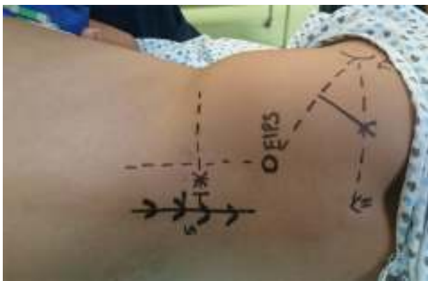
Image 2 – Superficial markings on the patient: sciatic nerve block using the Winnie 5 modified Labat 4 technique and lumbar plexus block with the Capdevilla 6 technique.

The hemodynamic parameters were stable during the procedure with arterial blood pressure measurements between 68 and 80 mmHg, HR 96–105 lpm, SpO 2 82–90%. Bleeding was minimal. At the end of the procedure the patient was admitted to the pediatric ICU with Aldrete score of 9, 2 in Ramsay's scale, 3 in Bromage's scale, 0 pain in the visual analog scale.