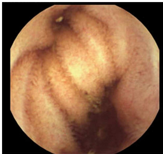
Figure 1 Double lumen image in the middle ileum suggesting a diverticulum.

Meckel's diverticulum is the most common congenital anomaly in the GI tract. It results from a persistent remnant of the omphalomesenteric duct and it is usually located in the antimesenteric side of the middle/distal ileum. It has