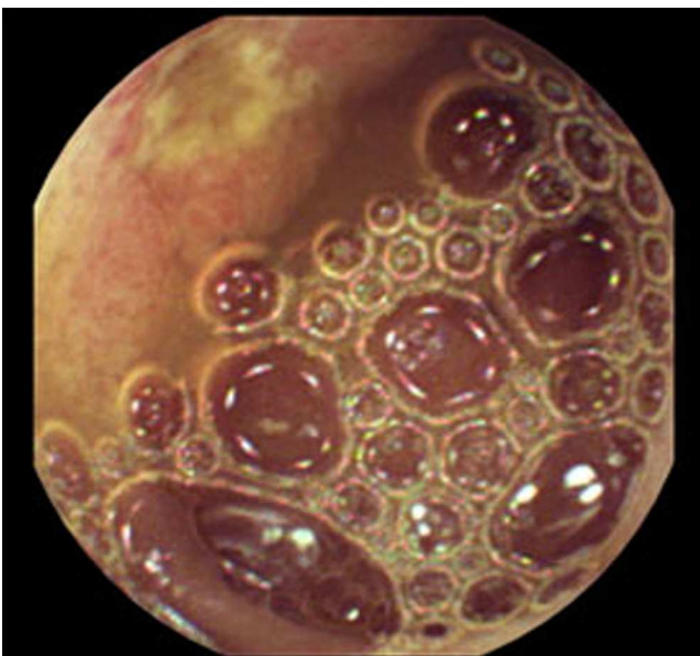
Figure 3 Congestive and ulcerated mucosa in the terminal ileum.

an estimated prevalence of 2% in general population and it is twice more prevalent in males. 1 Histological evaluation reveals ectopic tissue in 10–20% of the cases, mostly gastric mucosa. 2 Nevertheless, the embryological origin of this later phenomenon is not well known. Meckel's diverticulum is often asymptomatic and only 2–4% will develop a related complication during the life course. Gastrointestinal bleeding is the most common manifestation in adults. 3 Ectopic gastric tissue leads to acid secretion and consequently to mucosal ulceration downstream from the diverticulum. Hence, an obscure or overt GI bleeding may rarely occur. A nuclear medicine study using 99m technetium pertechnetate – Meckel's scan – has been used for diagnosis. Nevertheless it is only able to diagnose