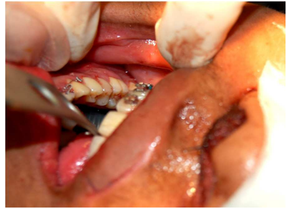
Fig. 5 – Intraoral region image that shows how the tube passes through the orosubmental tunnel opening through a premolar region incision.