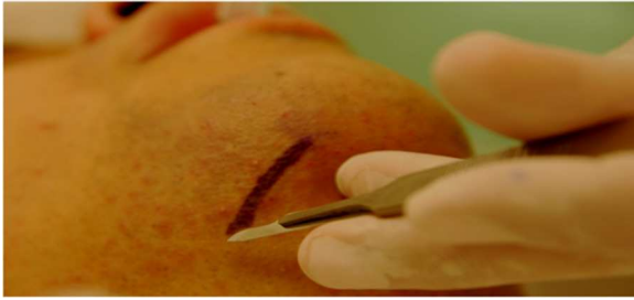
Fig. 2 – Reference for the incision in the paramedian submental region.