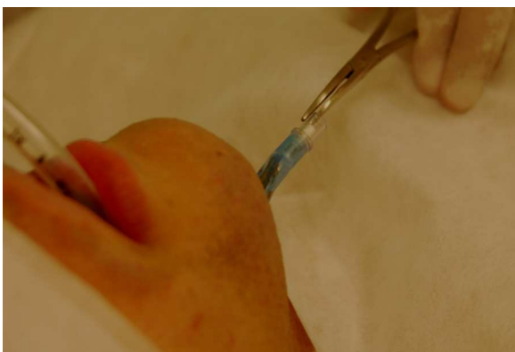
Fig. 4 – Cuff step through the incision.

At the end of the surgery, the reversion is performed by replacing the tube and, subsequently, the cuff through the incision made; the tube is re-connected to the anaesthesia machine, and the intubation becomes a classic oral intubation (Fig. 7).