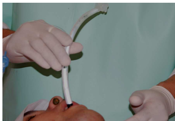
Fig. 1 – Classic intubation procedure.