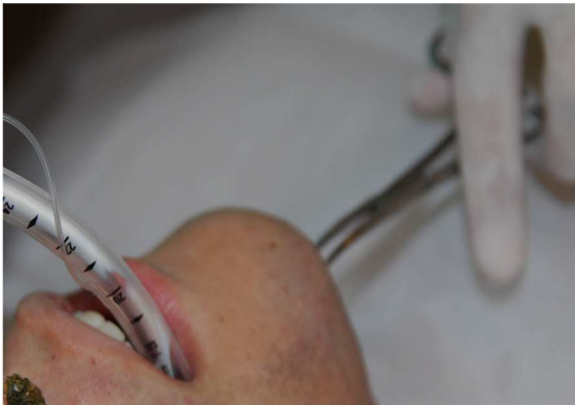
Fig. 3 – Tunnelling manoeuvre using pinches.

carried out with the proximal end of the tube after disconnecting it from the breathing system of the anaesthesia machine (Figs. 4 and 5).