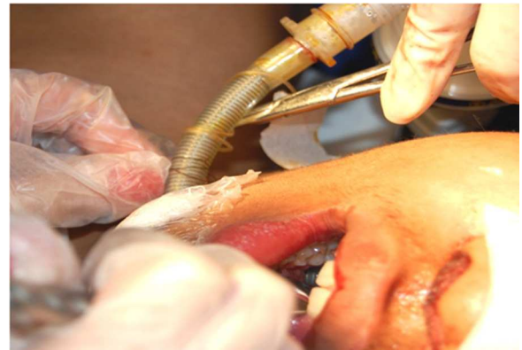
Fig. 6 – Endotracheal tube after passing through the orosubmental tunnel. The tube is fixated in its position using nylon sutures.