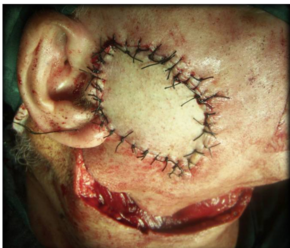
Fig. 4 – Submental flap in the operative bed.