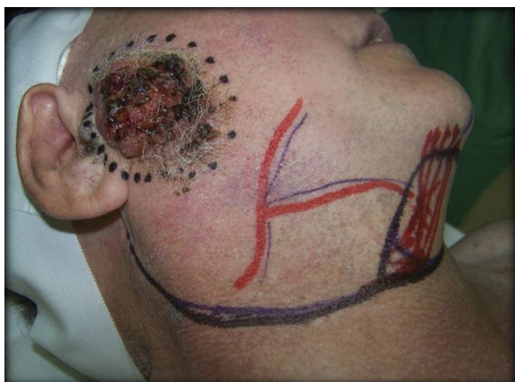
Fig. 3 – Preoperative planning.