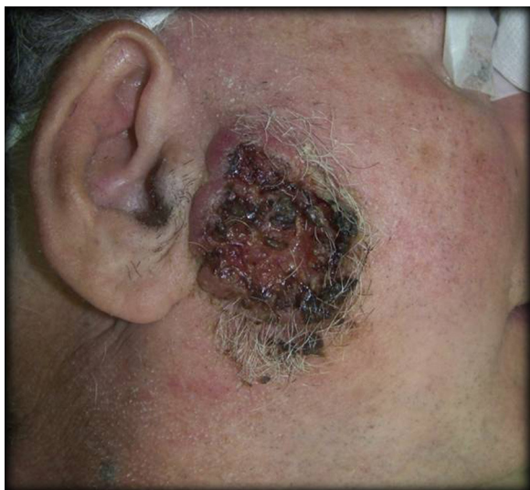
Fig. 2 – Basocellular carcinoma located in the preauricular area.