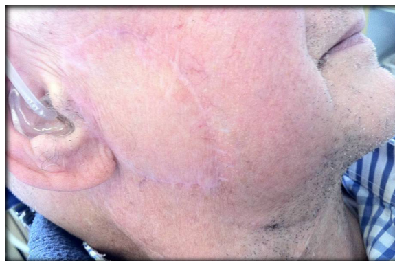
Fig. 5 – Clinical control at 12 months.

epidermoid carcinoma presented full flap necrosis due to a haematoma in the surgical bed and subsequent vein thrombosis. Another case of partial necrosis was recorded (30%) in a patient who underwent surgery due to mucosal epidermoid carcinoma in the upper maxilla, also as a result of a haematoma in the surgical bed. Another patient who underwent surgery due to dermatofibrosarcoma protuberans in the nasogenian fold presented distal flap necrosis amounting to 10% of the surface. Lastly, there was a case of temporal paresis of the marginal branch of the facial nerve.